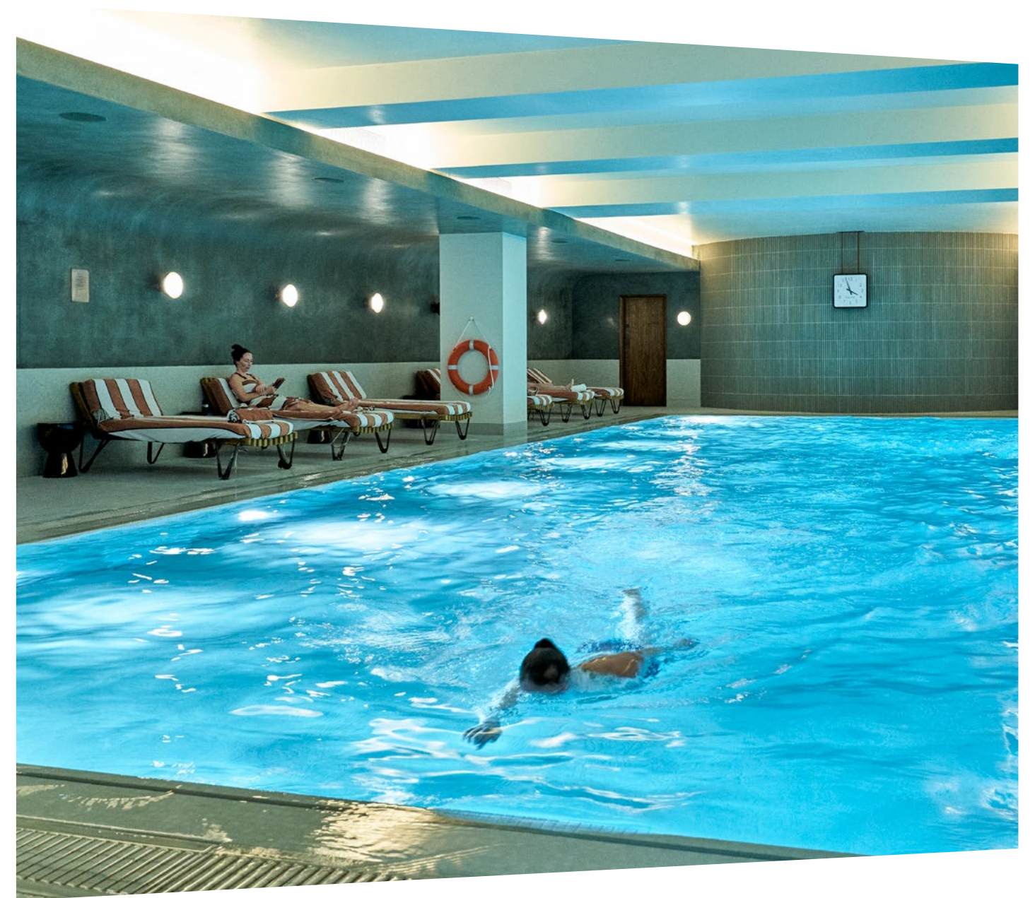
Swimming Pool The Helios

As a resident, you have access to the Soho House-managed gym located below the Helios building. It's a refined sanctuary where luxury and comfort come together. From the lively juice bar and the bustling gym floor to the diverse classes across four dedicated rooms, including areas for cardio and free weights. Conversely, you can seek escape at the tranquil lap pool, hammam, sauna, and steam rooms.