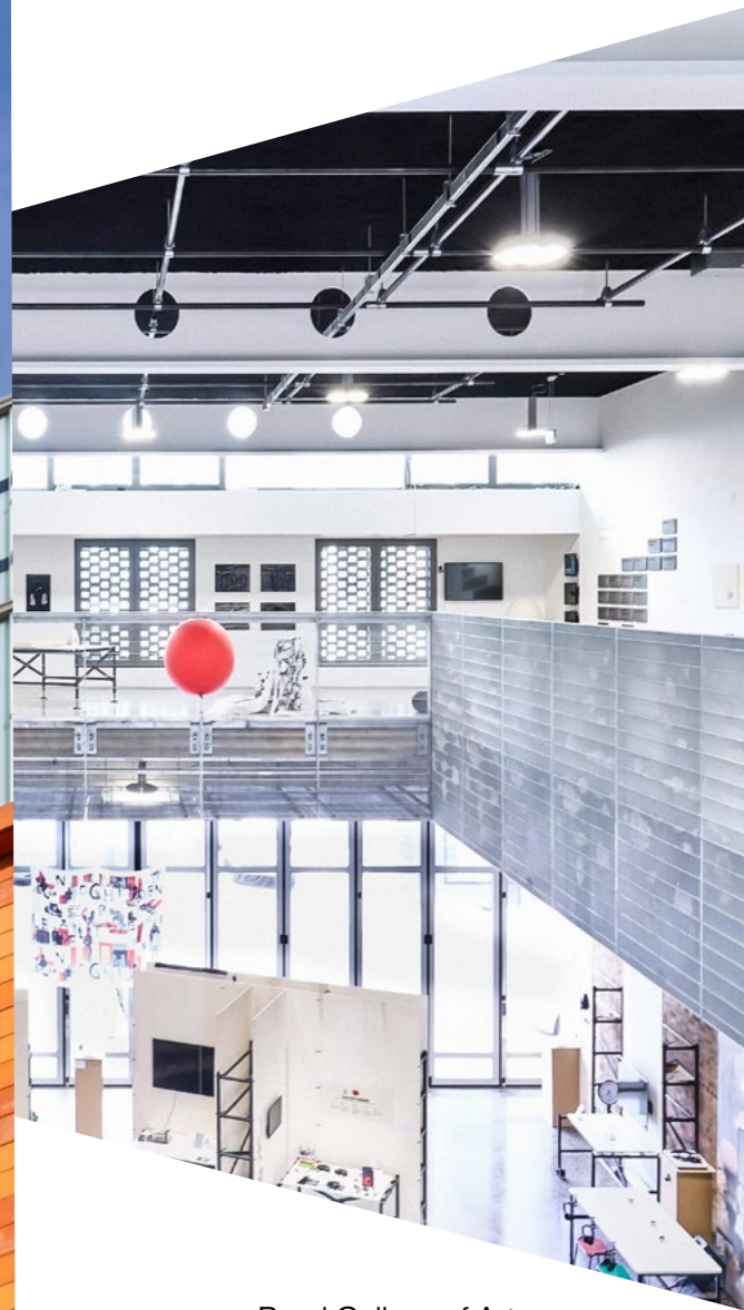
Royal College of Art 11 mins 🚶