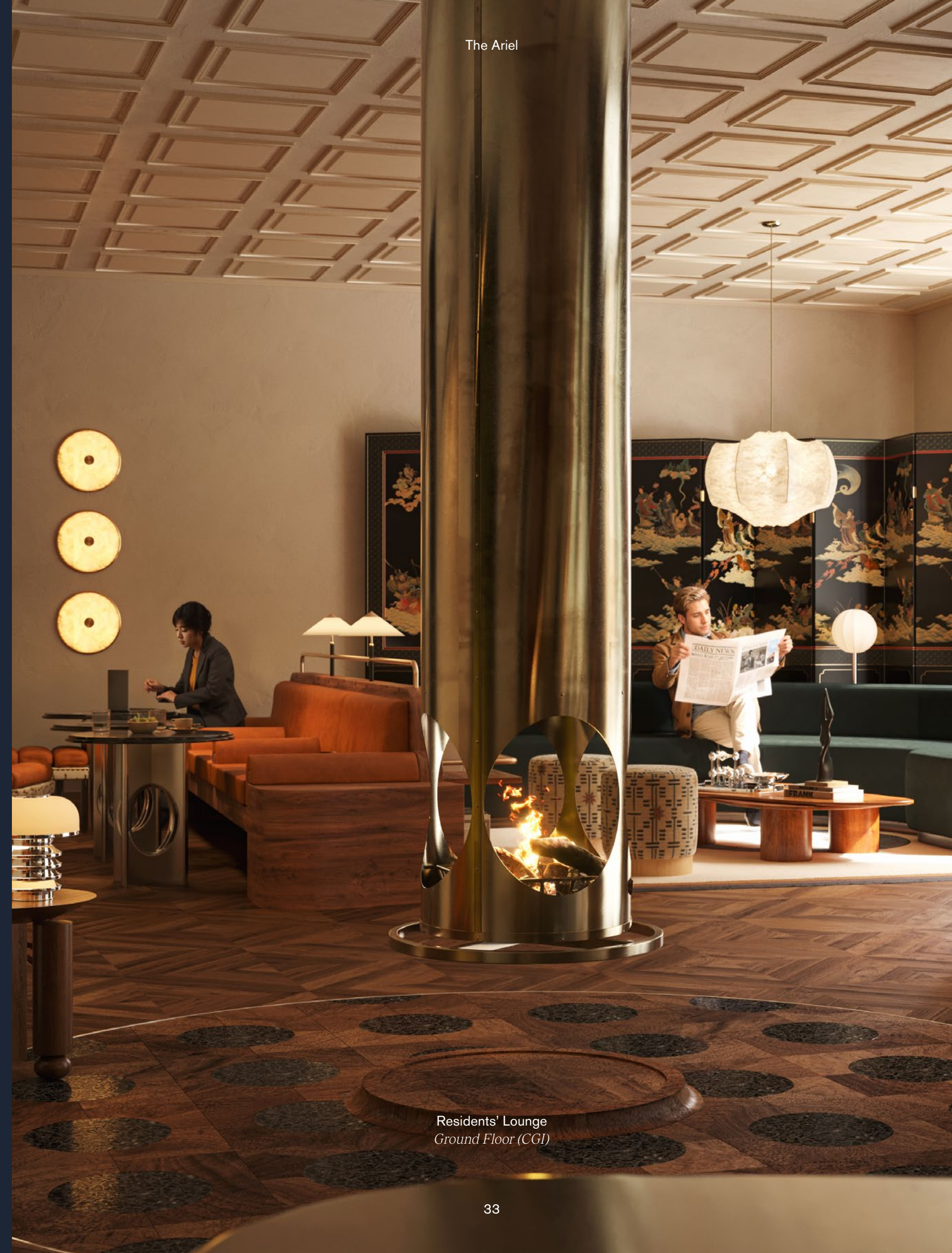
Residents' Lounge Ground Floor (CGI)

The lobby sets the scene. A stylish space created for meeting, lounging and co-working, it gives way to artfully curated contemporary living spaces that align details rich in design history with functionality for the future. The social-first energy extends up to the top of the building, where the 8th floor offers a meeting room or private dining space and a south-facing roof terrace for longer days, late nights and round-the-clock sights of the city beyond.