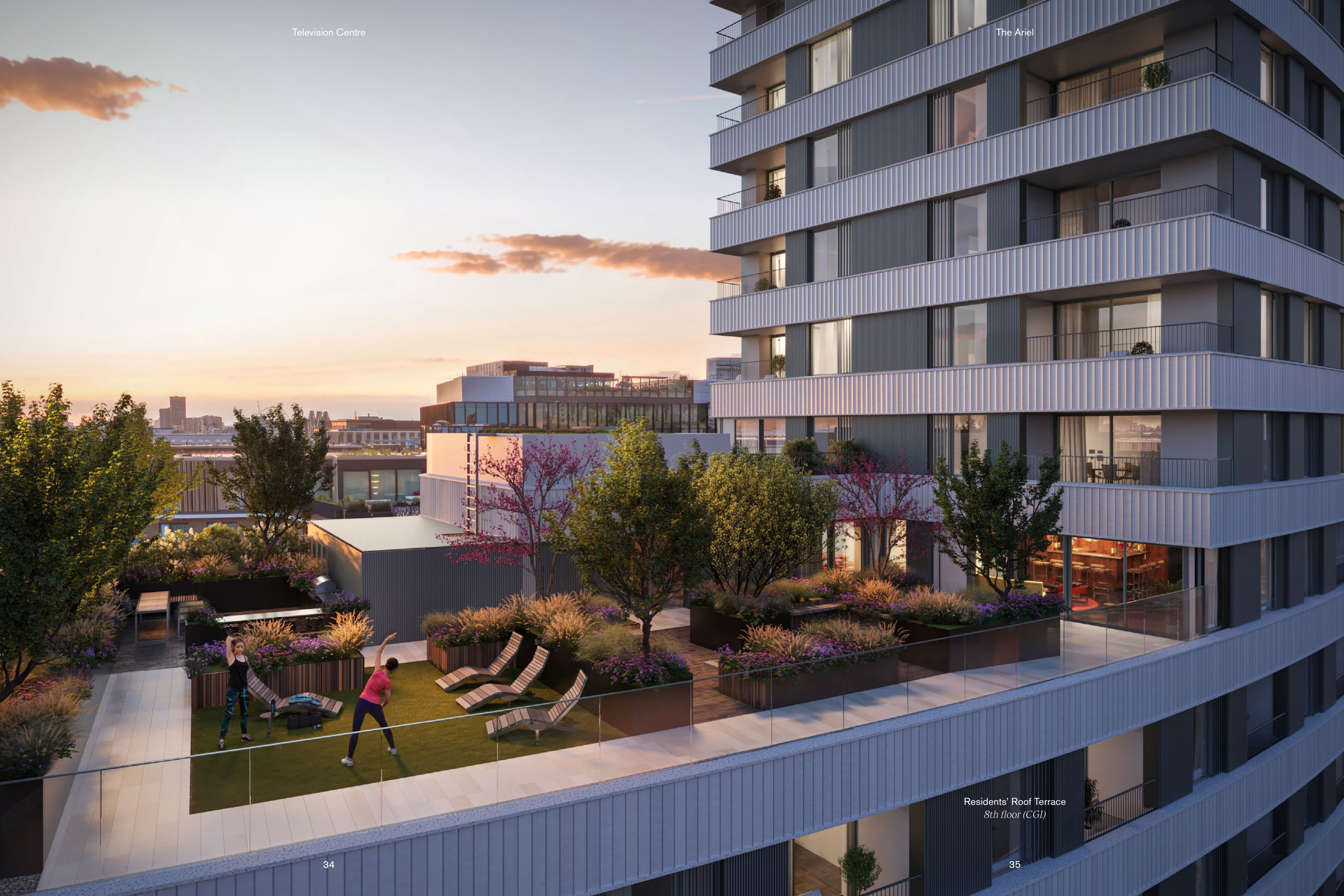
Residents' Roof Terrace 8th floor (CGI)