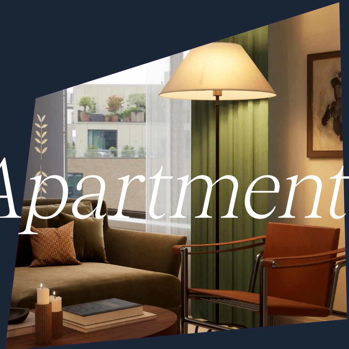
Living area Studio apartment (CGI)