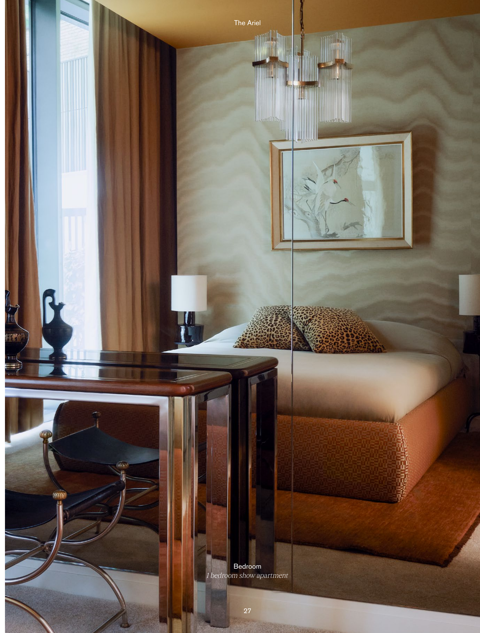
Bedroom 1 bedroom show apartment