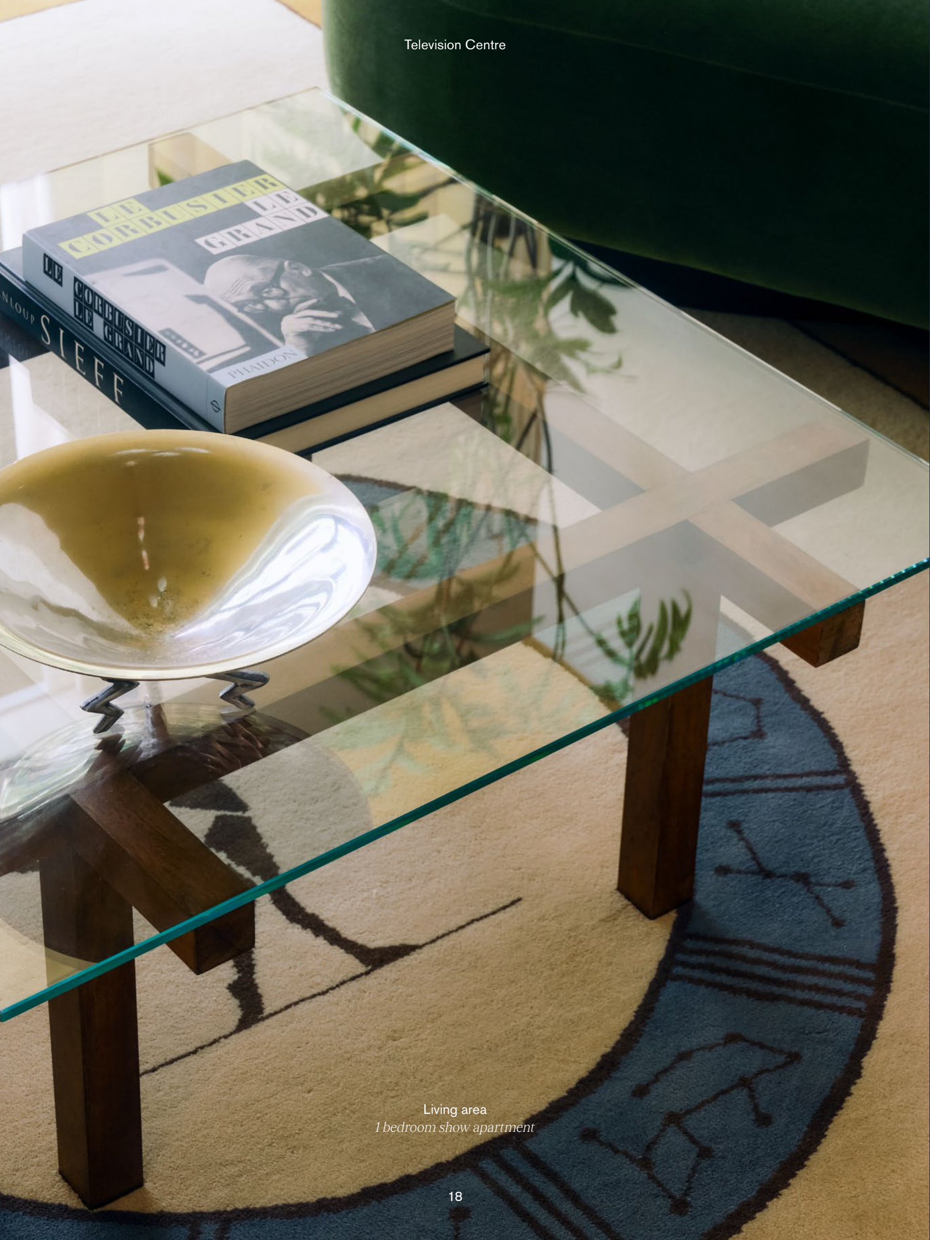
Living area 1 bedroom show apartment