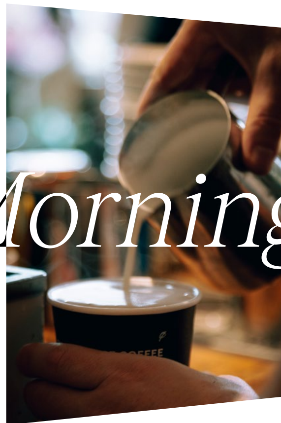
Flying Horse Coffee