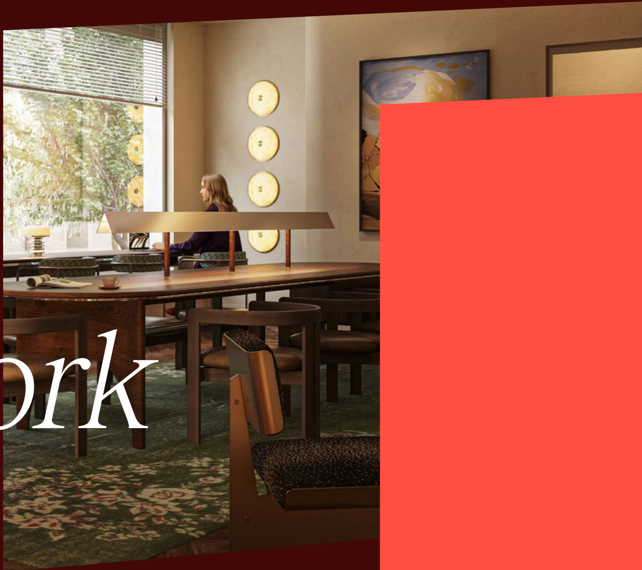
Co-working Space (CGI)