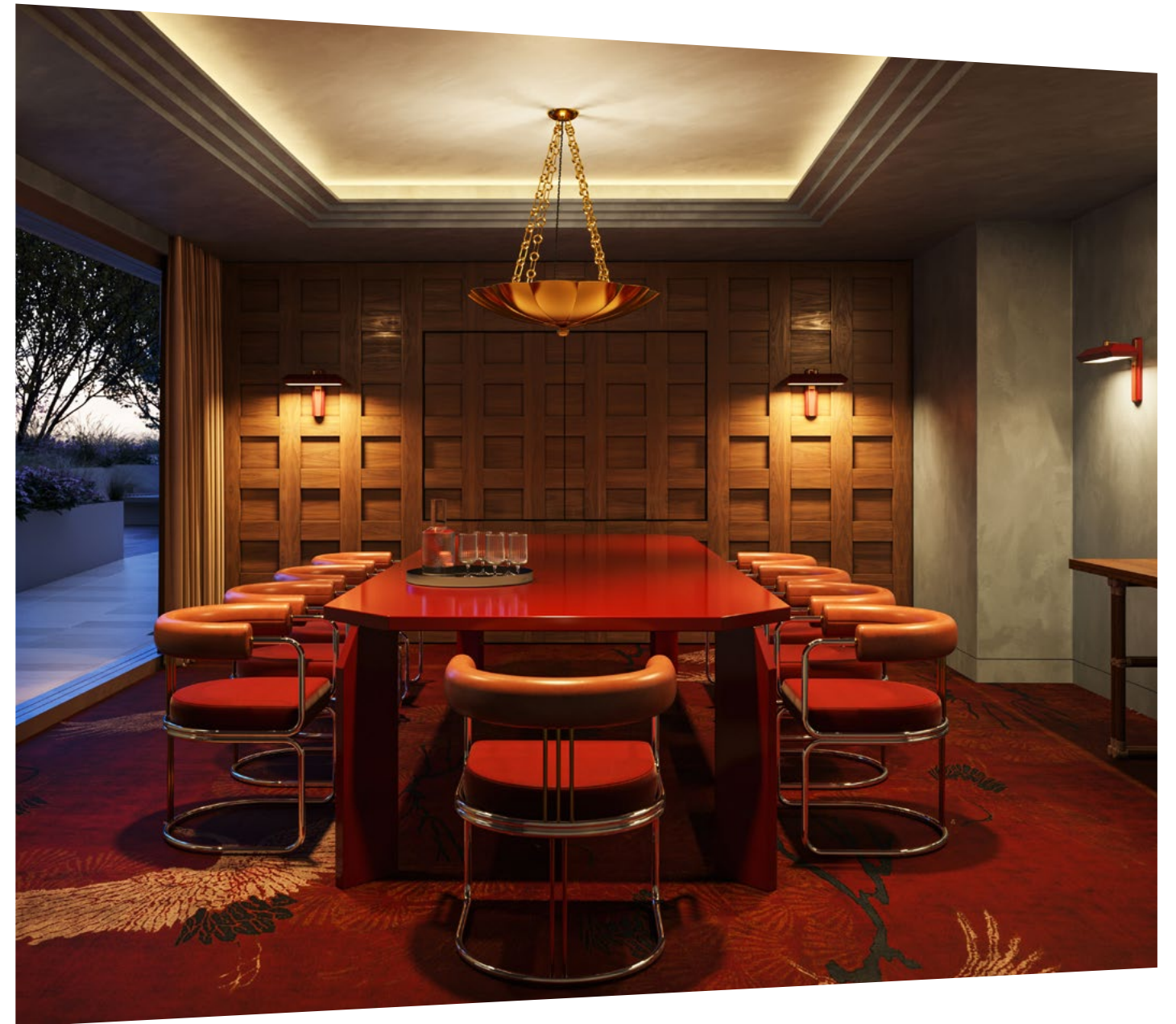
Private Dining 8th floor (CGI)