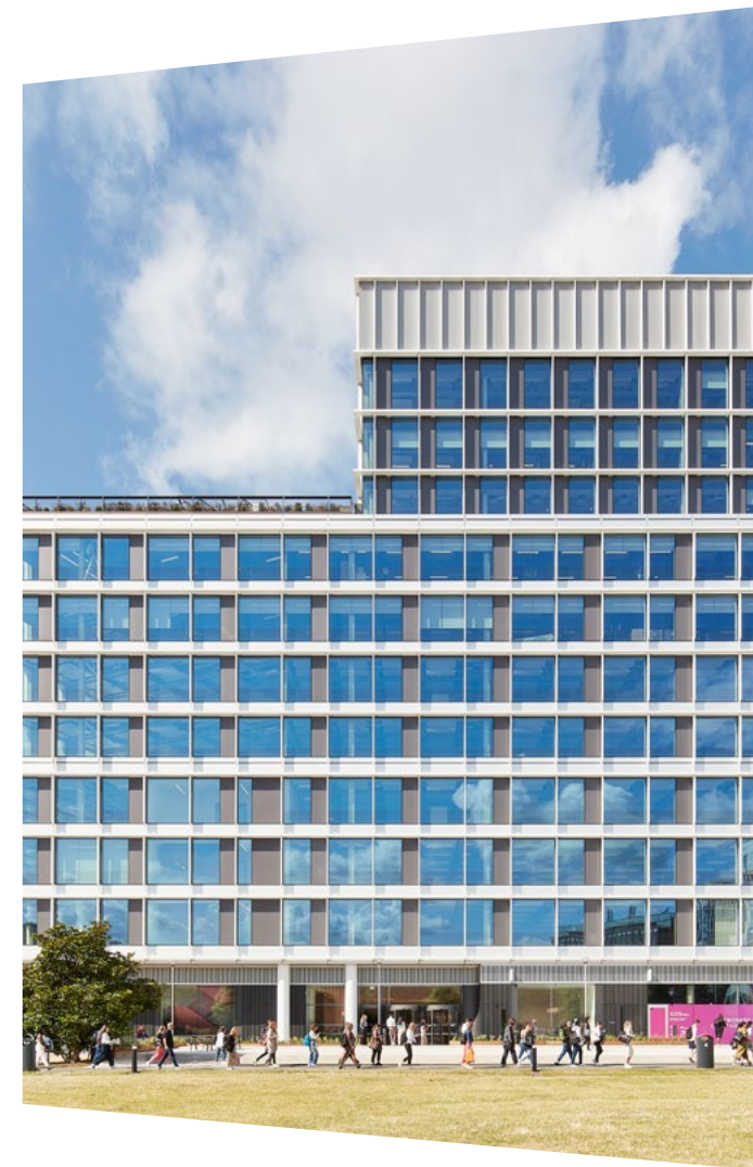
L'Oréal 13 mins 🚶