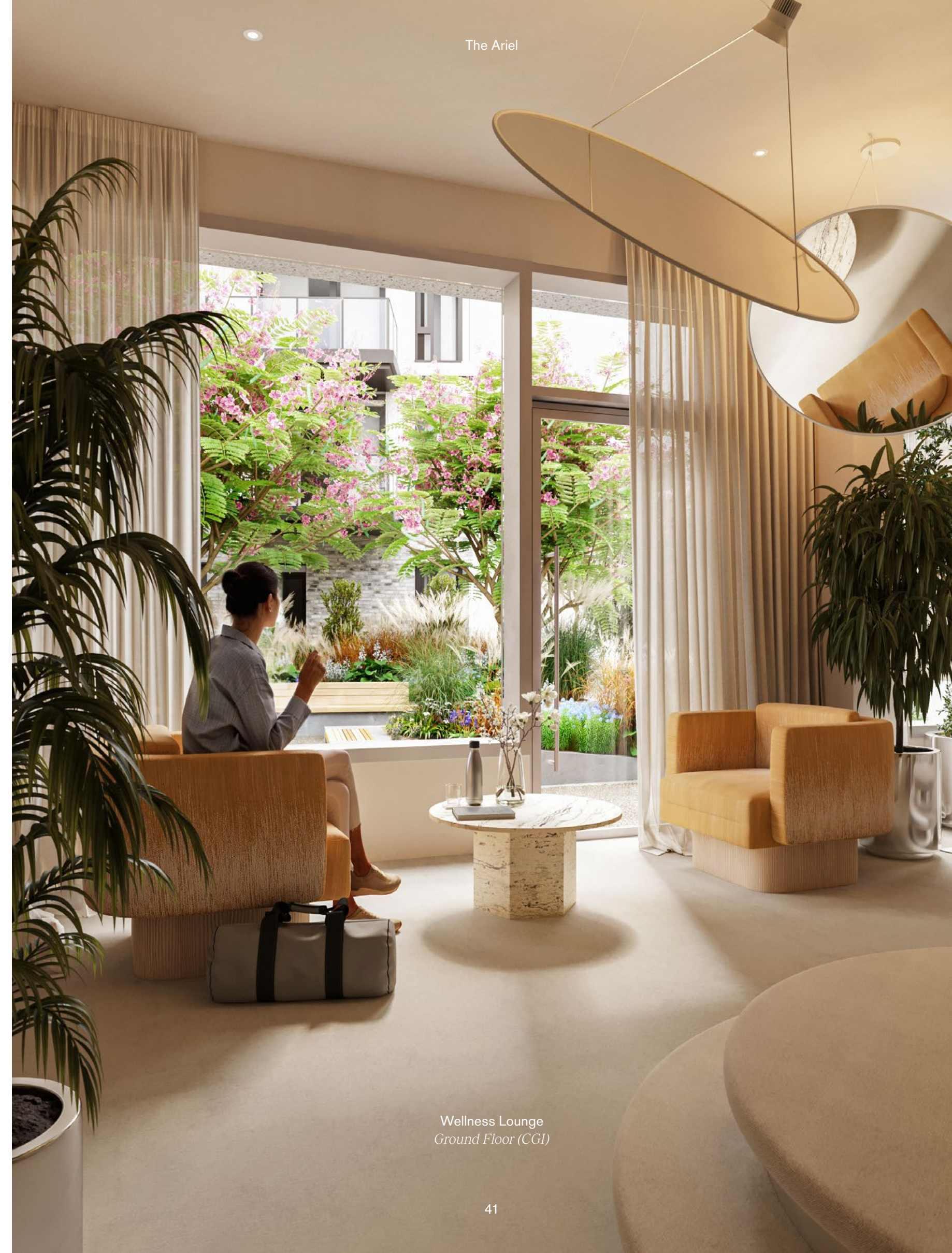
Wellness Lounge Ground Floor (CGI)

Introducing the wellness suite at The Ariel, a serene oasis designed to elevate your well-being. With fully equipped personal training and yoga & pilates studios, it offers the perfect environment for personalised training sessions and mindful movement. Afterwards, retreat to the wellness lounge or treatment room, a tranquil spaces ideal for unwinding or simply taking a moment to pause.