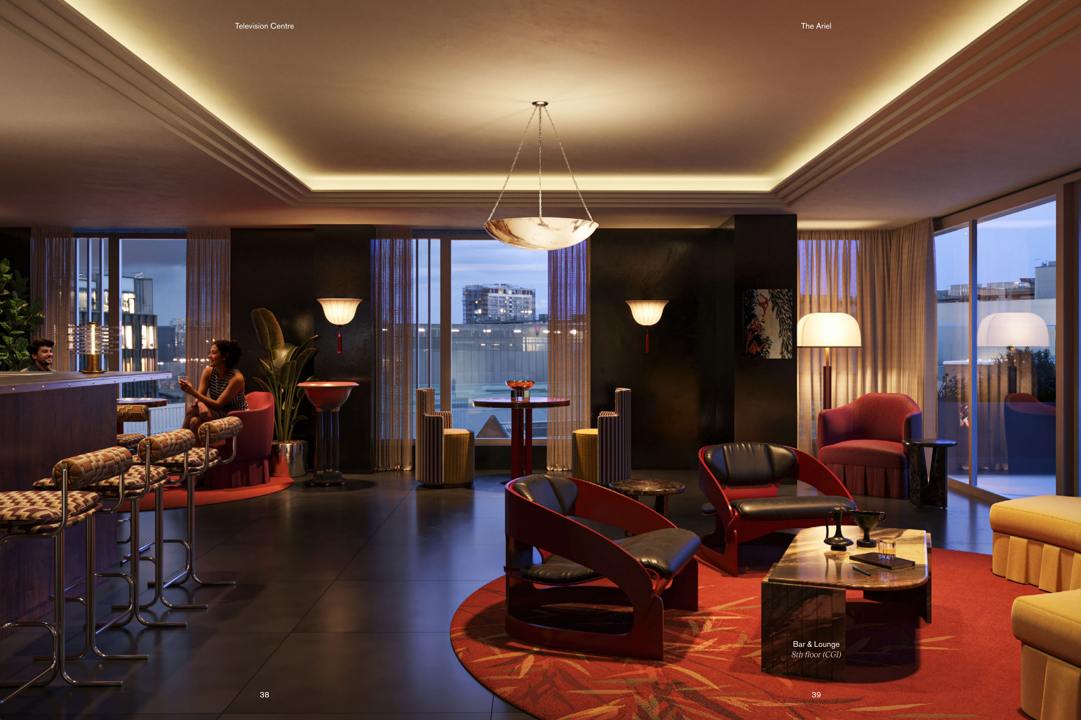
Bar & Lounge 8th floor (CGI)