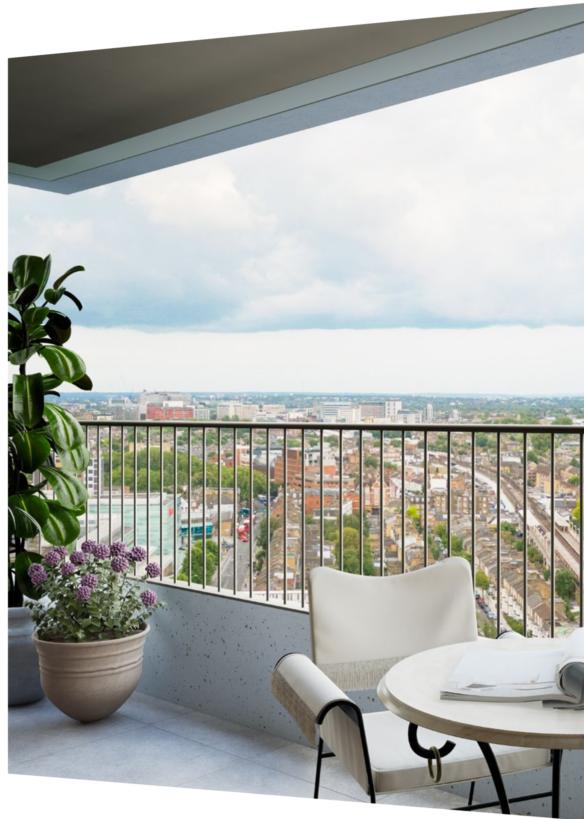
Inset balcony 3 bedroom apartment (CGI)