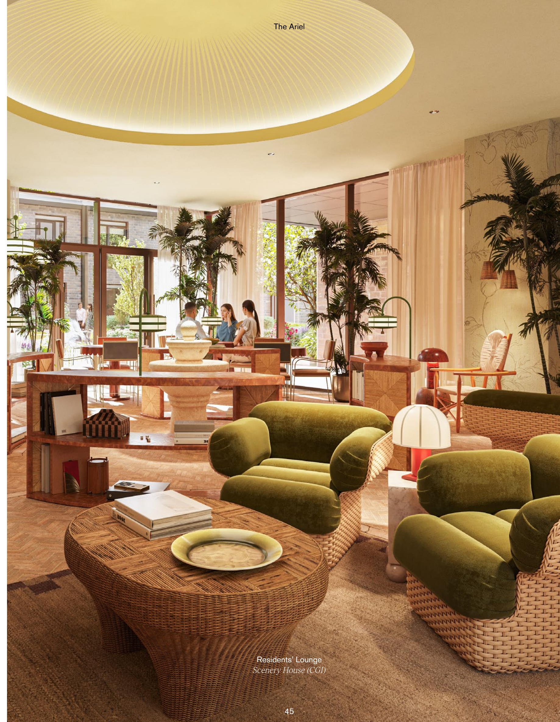
Residents' Lounge Scenery House (CGI)

The resident amenities are set across the estate to enrich our community and connect our neighbours. Scenery House next door, features a cosy 16-seat cinema and lounge, all designed to complement your lifestyle.