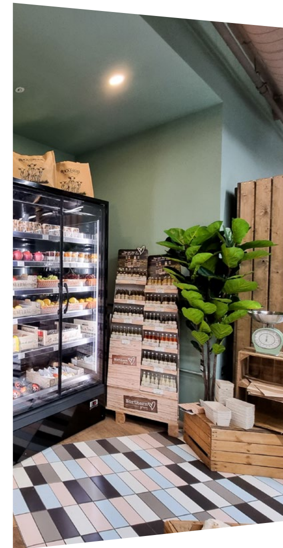
The Black Farmer