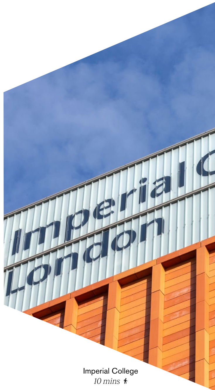
Imperial College 10 mins 🚶