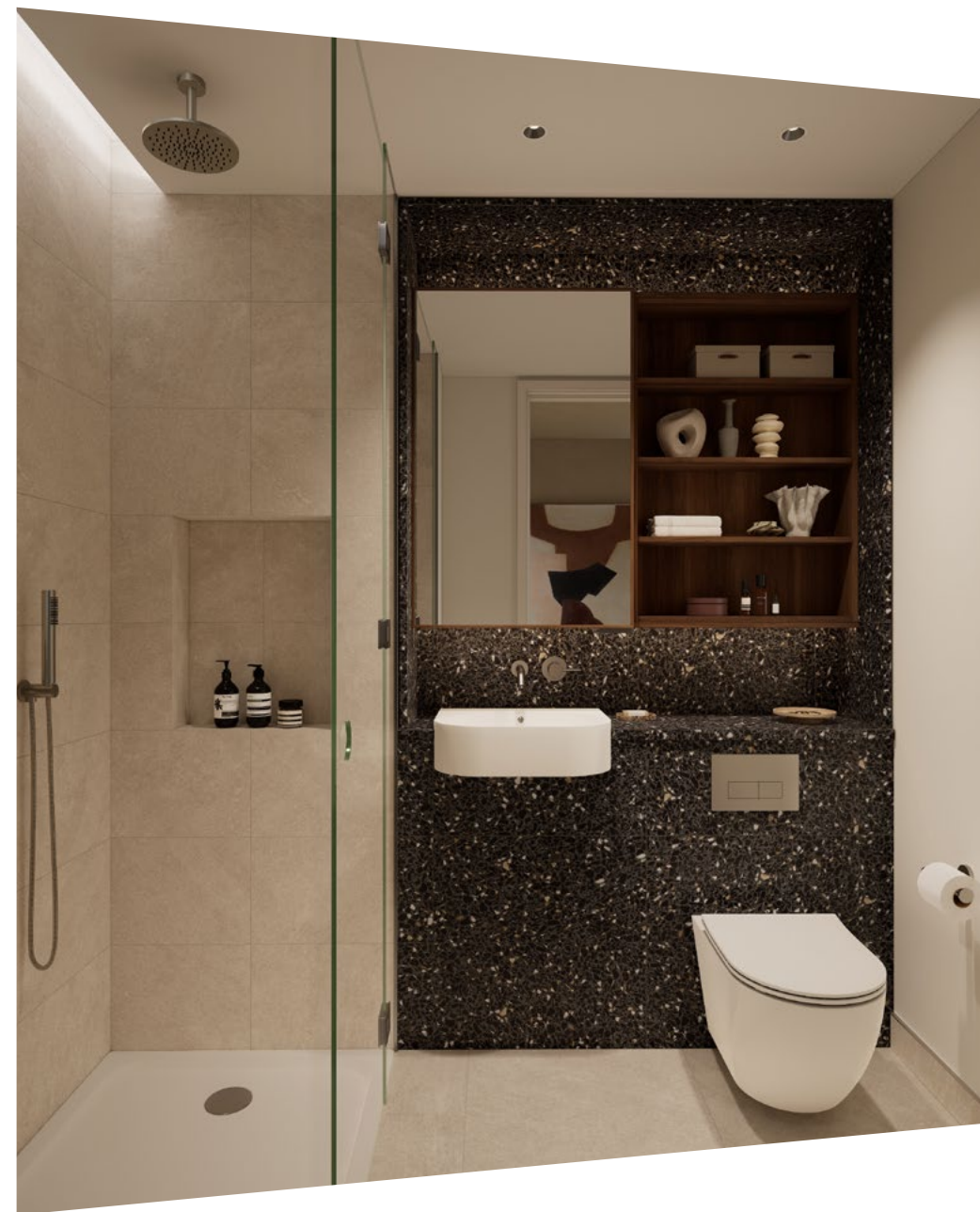
Bathroom 2 and 3 bedroom apartments (CGI)