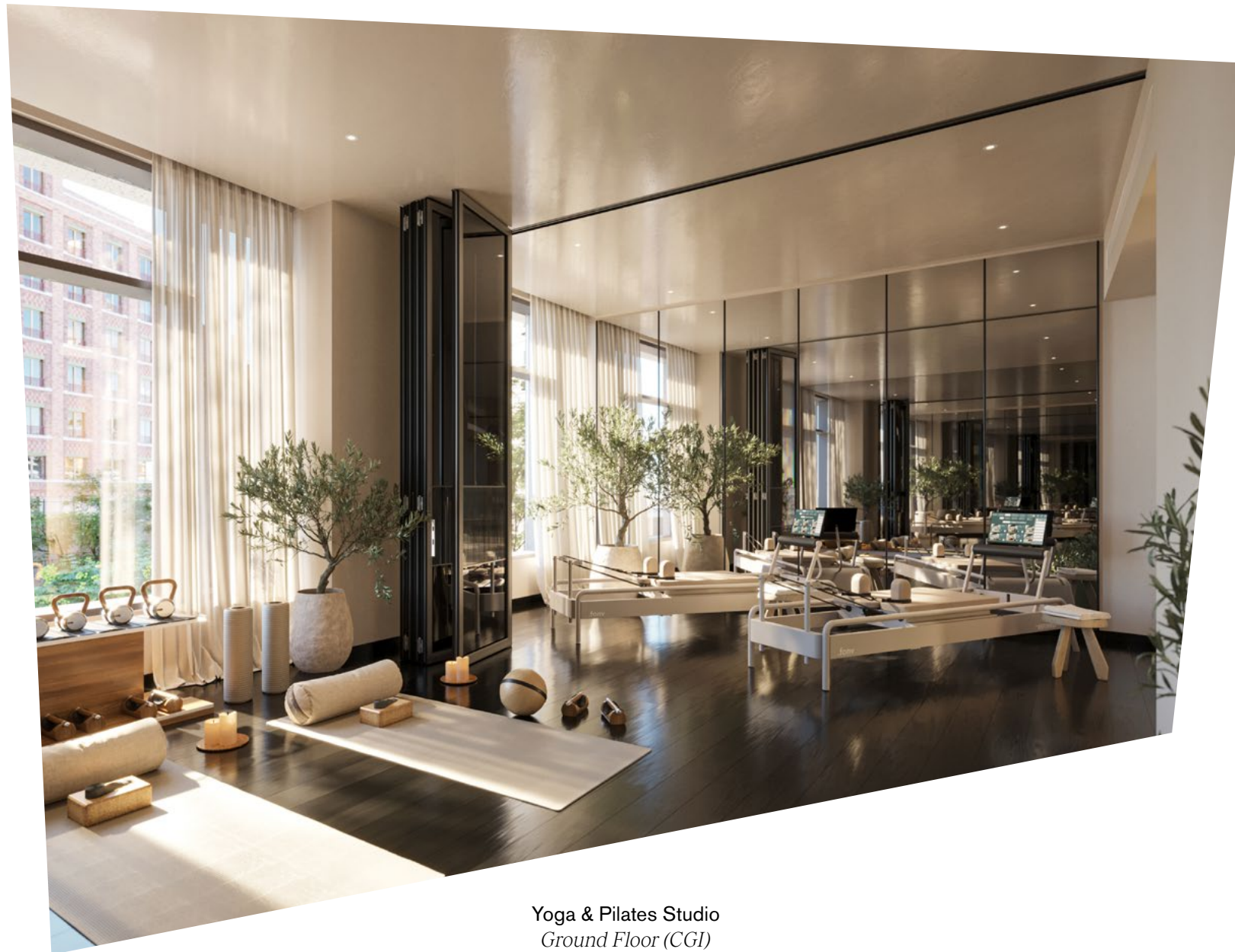
Yoga & Pilates Studio Ground Floor (CGI)

Introducing the wellness suite at The Ariel, a serene oasis designed to elevate your well-being. With fully equipped personal training and yoga & pilates studios, it offers the perfect environment for personalised training sessions and mindful movement. Afterwards, retreat to the wellness lounge or treatment room, a tranquil spaces ideal for unwinding or simply taking a moment to pause.