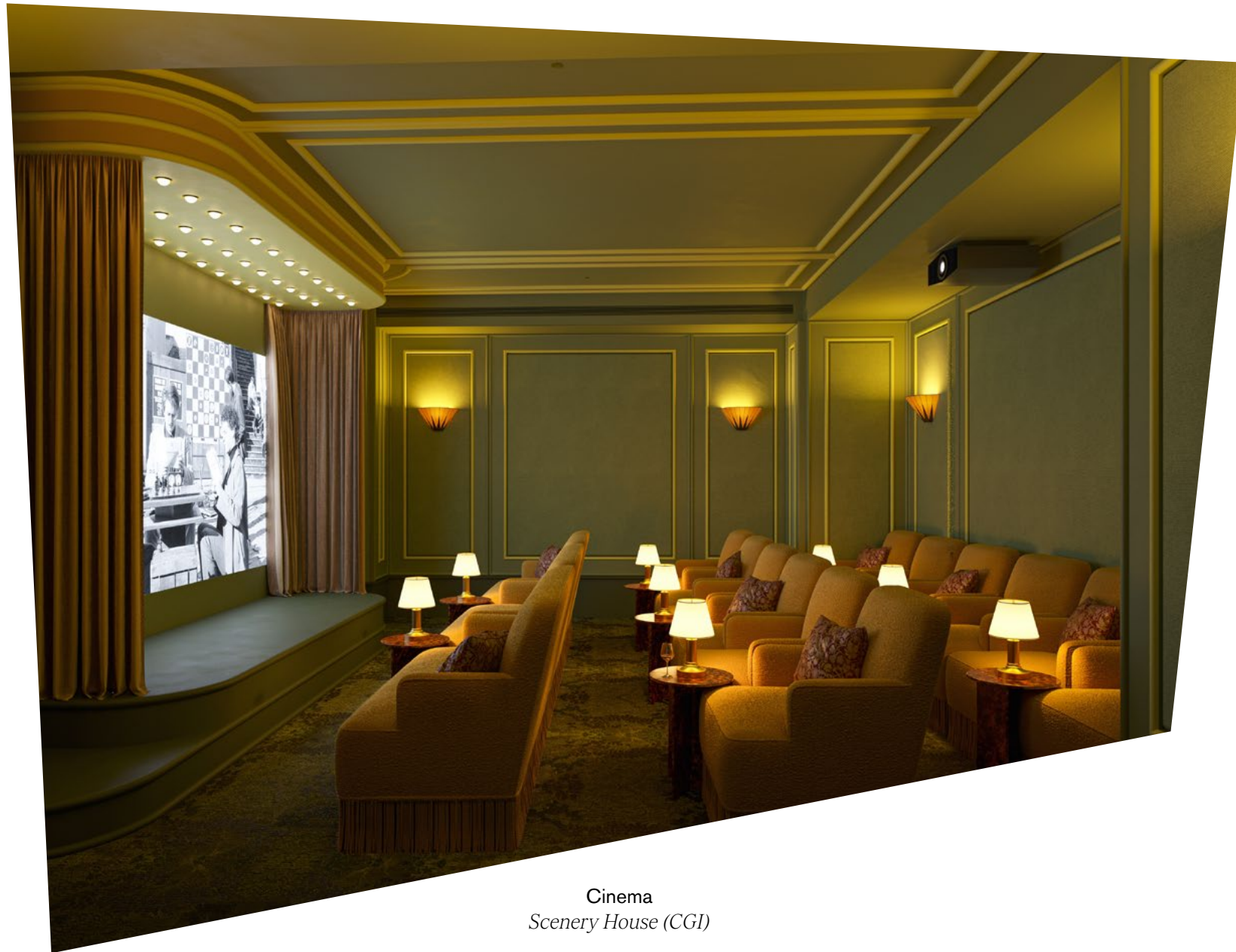
Cinema Scenery House (CGI)

The resident amenities are set across the estate to enrich our community and connect our neighbours. Scenery House next door, features a cosy 16-seat cinema and lounge, all designed to complement your lifestyle.