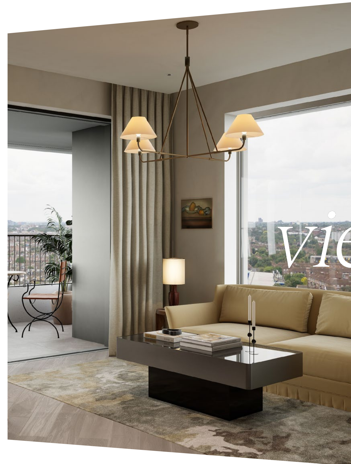
Living area 2 bedroom apartment (CGI)