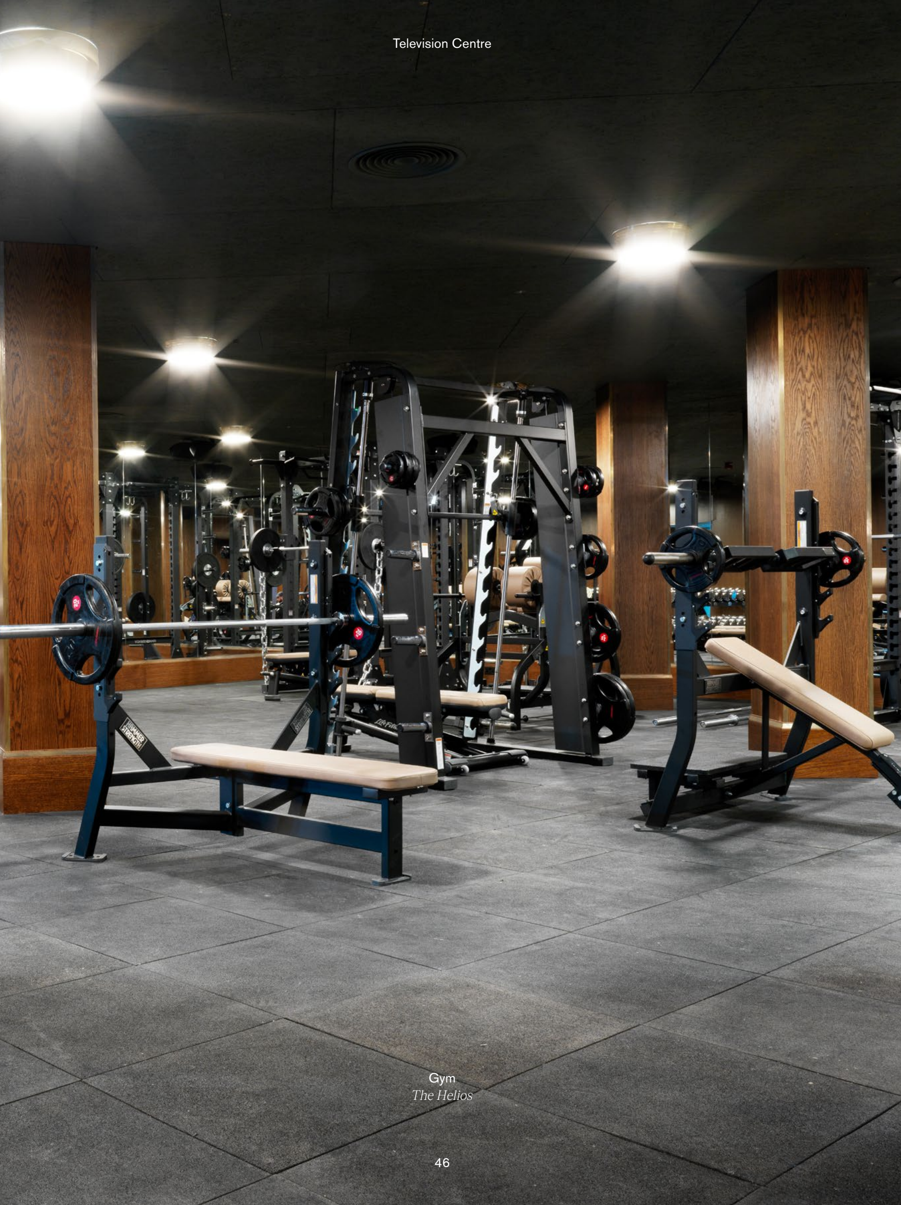
Gym The Helios