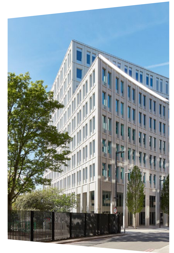
PVH, Calvin Klein and Tommy Hilfiger On-site 🚶