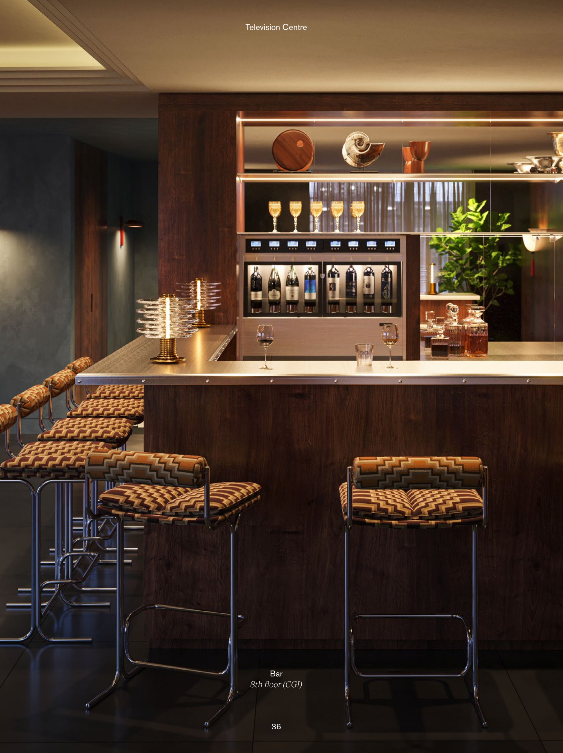
Bar 8th floor (CGI)