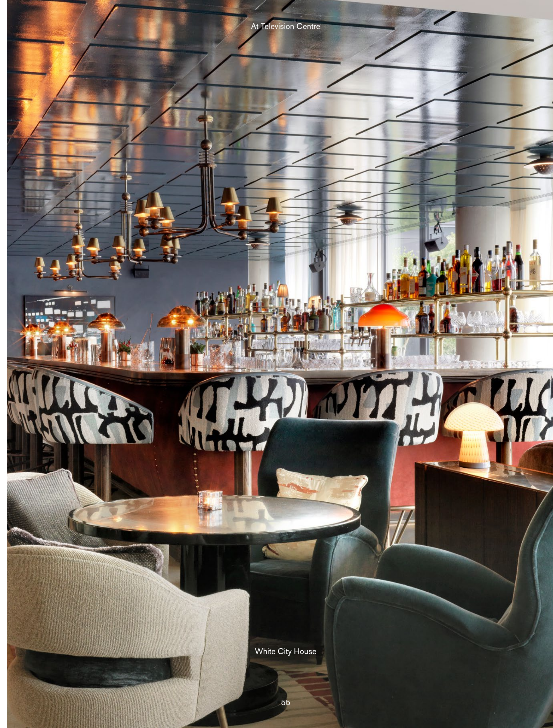
White City House

Steps from your sofa, Electric Cinema brings the big screen to you, while the TV Studios invite you behind the scenes of your favourite shows. Experience entertainment with ultimate ease.